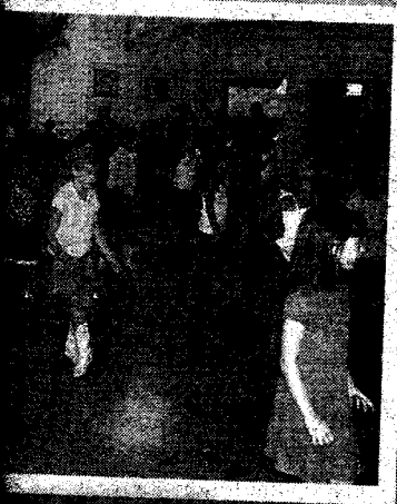
Above, Ladies - Dosidos - and I don't mean Cookies!

As you work on your own family budget, please make sure that you leave something for the poor and less fortunate. Also, be an advocate for the less fortunate in our own local legislatures to be sure that as cuts are made here in the County, there is a preferential option towards those less fortunate.