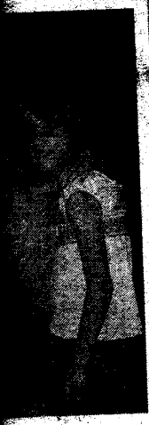
At left, Square Dancin' Brownie Buddies